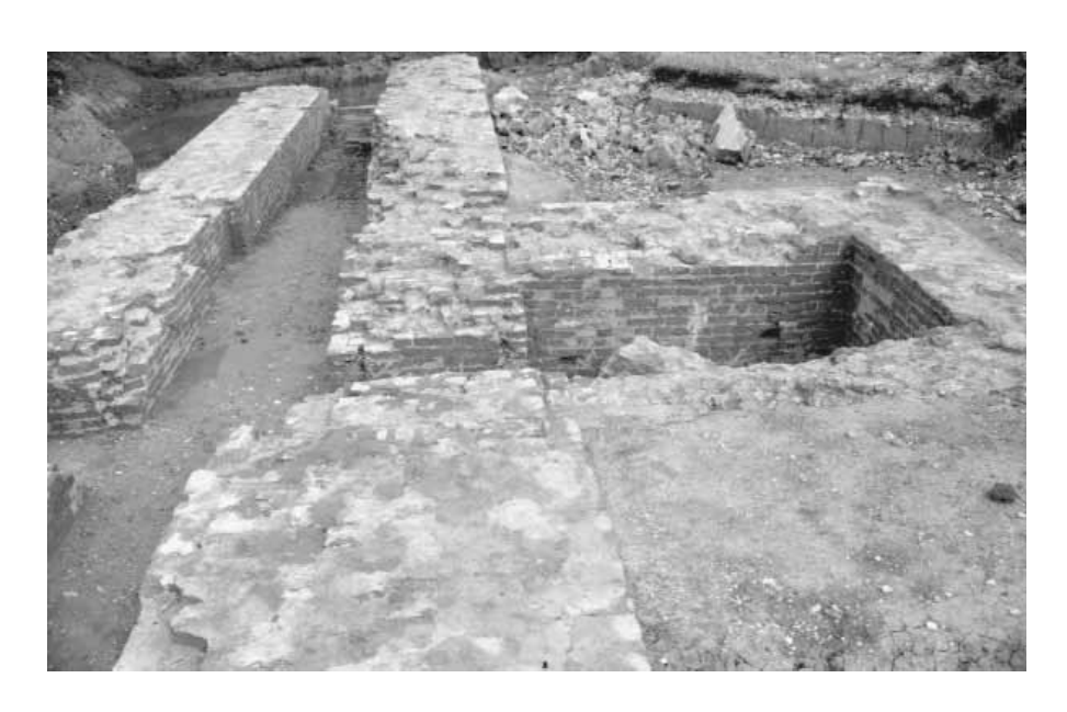
Sentry post in east sally port