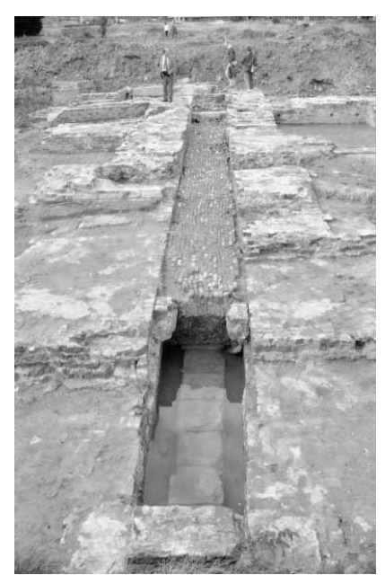
Path and drain under magazines