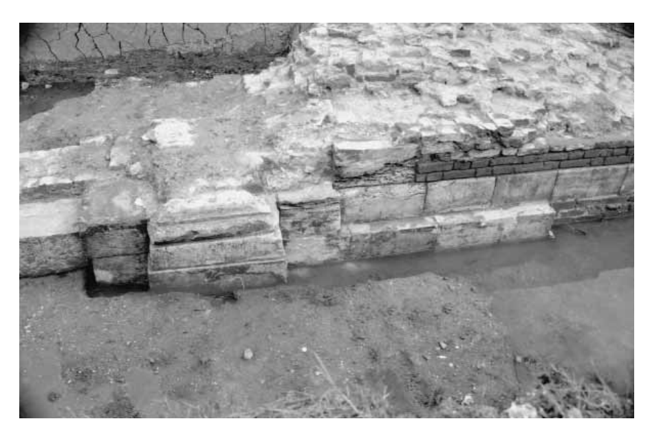
Column base of main entrance