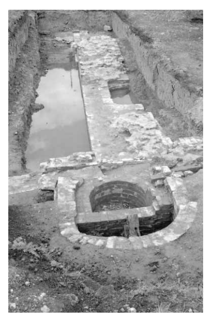
Main entrance (top), fireplace, sentry post / base of spiral staircase

use in the 1840s and demolished in 1864.