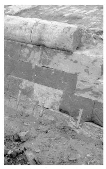
Humber wall, top of stone facing, lead tie-pins