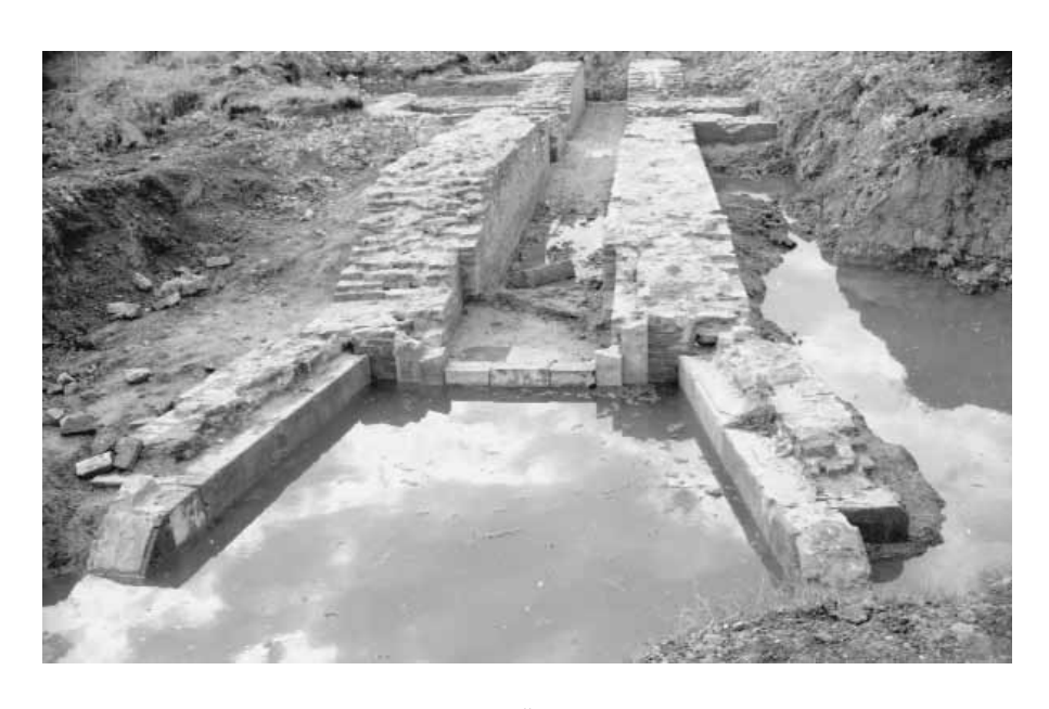
East sally port