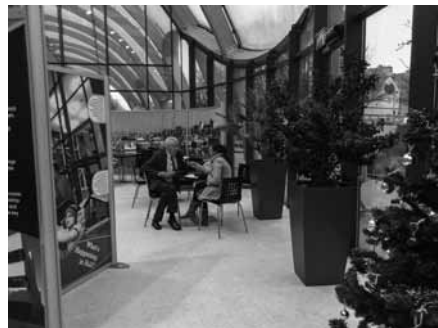
The launch in Hull History Centre

in. It has often been commented that Hull gets a bad press nationally, mainly from people who have never been, however, visitors are usually pleasantly surprised. It could be argued that having a football team in the Premier League probably did more to correct Hull's negative image than anything we in the 'heritage sector' could ever do but for people who wish to explore the city in more depth this booklet should be their first reference.