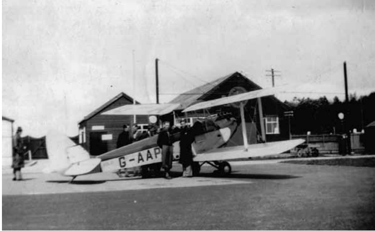
Club members standing near a biplane on Sunday, 12 May 1935. The location shown is close to the Staithes Road railway crossing. The smaller building, left centre, is the ambulance hut and the larger one the club's offices.

church of long ago, with the monks chanting in their stalls and all the lavish splendour of medieval ritual. Yes it seemed a link with the past, and the same might be said with equal truth of the town itself, for Hedon seems