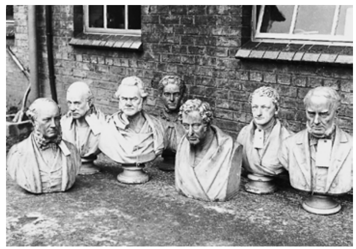
Busts awaiting transfer from Prospect St to Sutton, late 1960s