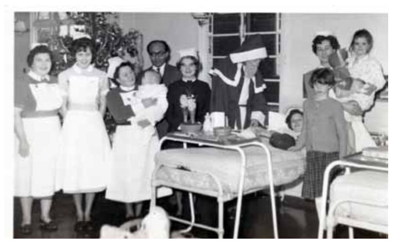
East Riding General Hospital, Driffield-christmas 1960