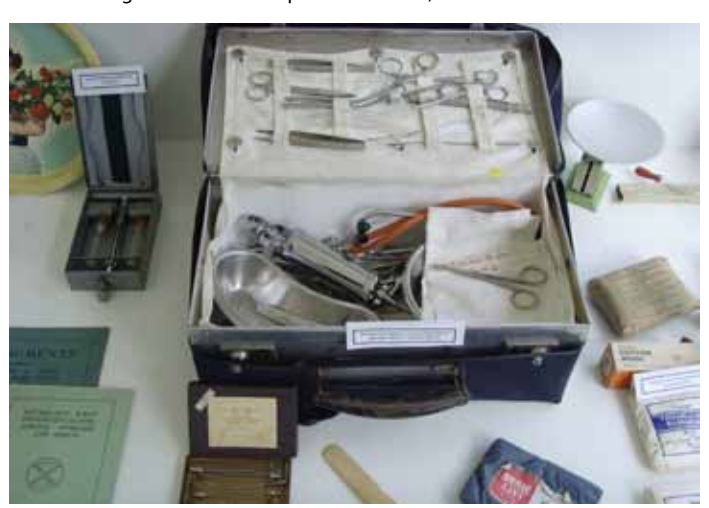
District nurses equipment case from the 1960s

The existence of the Unit, which has only recently been made public followed the publication of a brochure featuring the developments on the present Castle Hill Hospital site over the last century. The publication itself created far more interest than was anticipated and was initially intended only as an in-house project. The Trust however attached