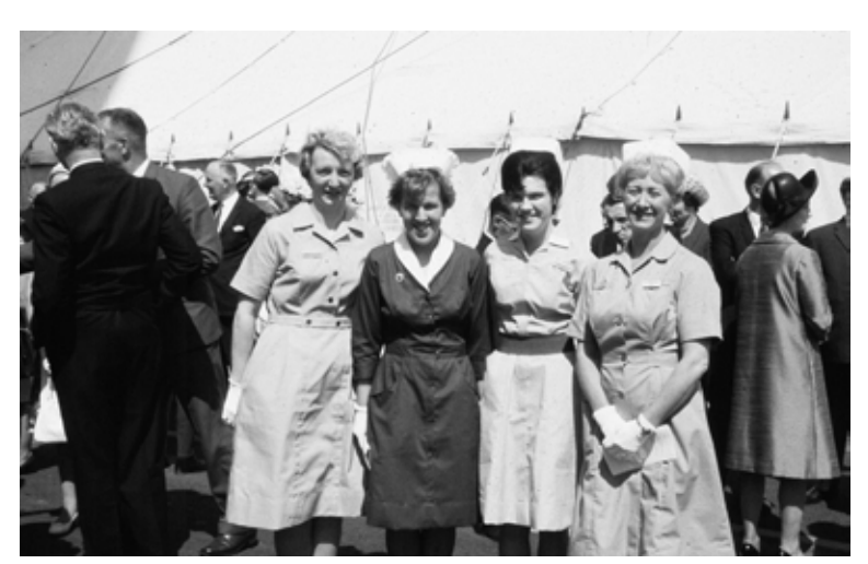
New HRI - 1967, Queens visit for opening

As mentioned above the archive collection presently contains many items from the hospitals in Hull and the East Riding, which include: