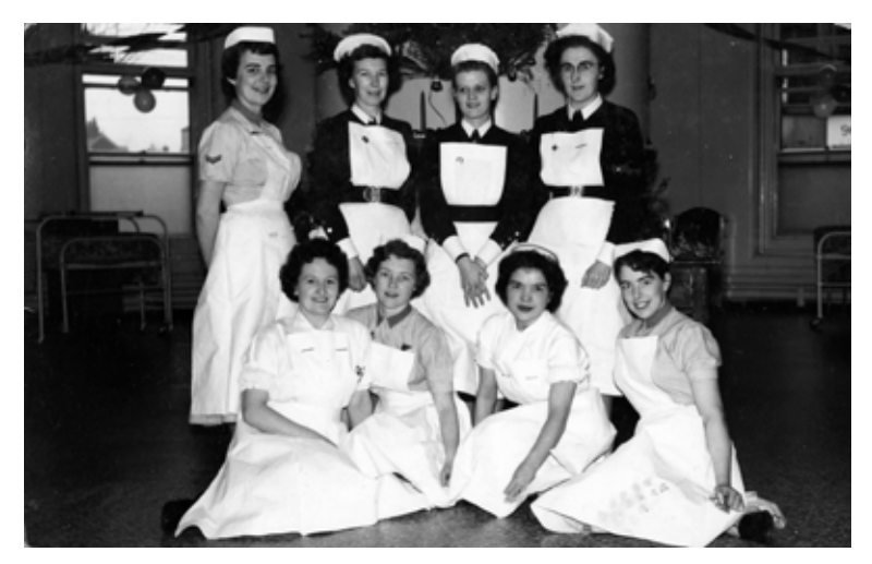
Staff at the old HRI Christmas 1959

The Hull and East Yorkshire Hospitals NHS Trust was established only in October 1999 though, as you will know has a foundation which dates back over 200 years, a long time before the creation of the NHS in 1948.