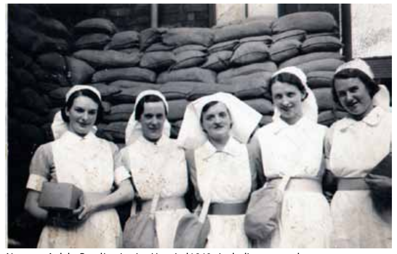
Nurses at Anlaby Road Institution Hospital 1940s, including gas masks.

The collection however does not only contain written documentation as several three dimensional items are also held by the Unit, these include busts, plaques, medical/surgical equipment, uniforms and much more.