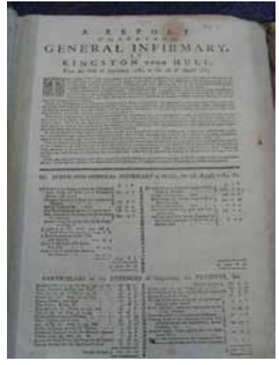
The 1st Annual Report of the infirmary, which gives figures of expenses, including the purchase of the Prospect Street site.

What is the Hospital History Unit you may ask and why has it suddenly come to light?