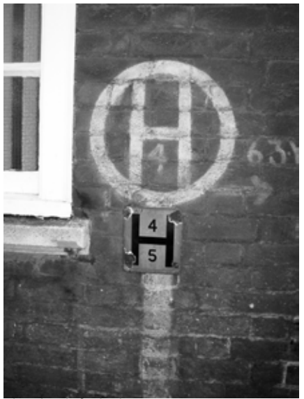
Church Side fire hydrant sign

We met by the King Billy statue in Market Place to begin our perambulation around the Old Town. King William of Orange was our first topic. The statue was designed by Peter Scheemaker who was the runner up in a competition, the winning