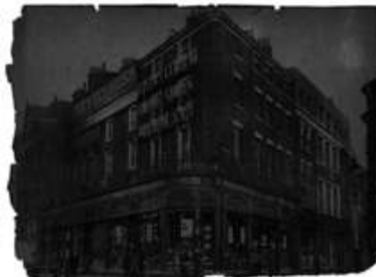
Central Coffee Store & Oriental Cafe, Saville Street

ed in 1904, which was renamed in 1913 the Octagon Café.