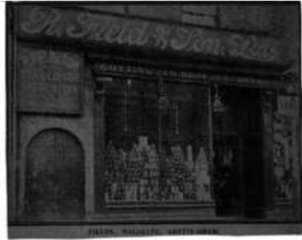
Hallgate, Cottingham. This branch was also an Oriental store

The firm of R Field & Co expanded by opening branches at 108 Beverley Road by 1879 and Hallgate, Cottingham by 1888. In 1892 a further shop was opened at 55 Saville Street