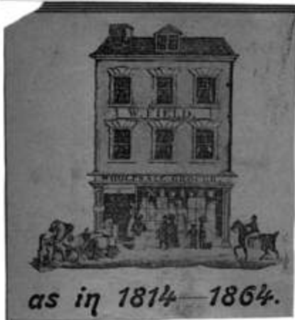
11 Market Place