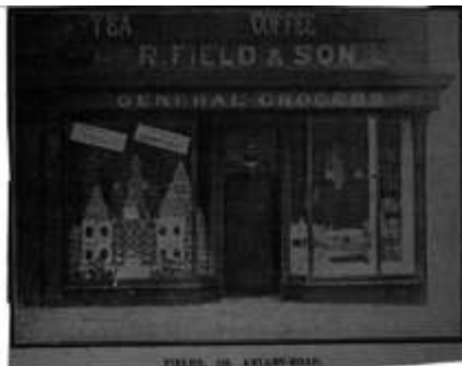
155 Anlaby Road