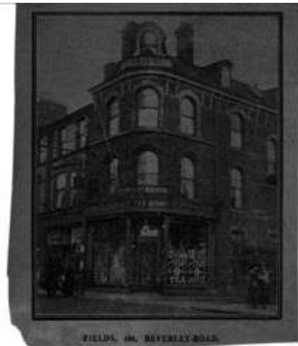
108 Beverley Road

as the Oriental Cafe and Coffee Store; they sold Oriental goods according to newspaper adverts. By 1897 there were branches in Leeds, Huddersfield and Bridlington Quay. In 1901 they were grocers at 11 Market Place, 108 & 224 Beverley Road, 155 Anlaby Road, 5-6 Junction Street and 3-6 St John's Street. There were also dining and refreshment rooms at 11 Market Place, 54-55