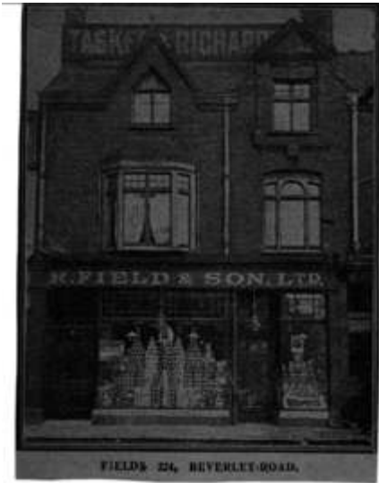
224 Beverley Road