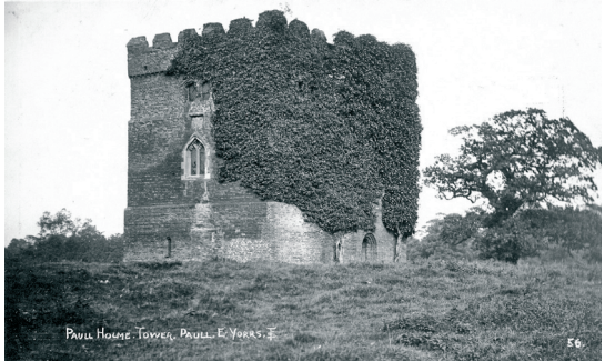
Paull Holme Tower in good repair, c.1910

now a Grade I listed building and has been already existing medieval timber framed placed on English Heritage's buildings at risk register. Known today as Paull Holme Tower, it is all that remains of a medieval moated manor house and it is the only remnant of the Holme family. The tower stands 35 feet high and is made of brick apart from some stone dressings above the windows. Its basement is brick vaulted and on the first floor, which appears to be just one large room, a fireplace and garderobe chamber are still discernible. Also discernible in the walls of the tower are portcullis slots indicating that this could have been a fortified manor house. A narrow staircase leads to the once crenellated parapet roof with a wall walk all the way around it. Early 19<sup>th</sup> century maps of the tower show an H shaped outline in the ground adjoining it which suggests that this surviving tower is only the north wing of a once grand house. These maps also show the moat and indeed the moat appears on Ordnance Survey maps up to 1927, but it is now lost. The 1672 hearth tax returns give us an indication of the size of the house, it had nine hearths. Only 3 of these are in the tower itself – further evidence that this is only part of a larger house.